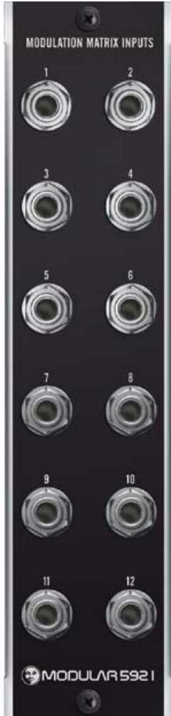
M 592i Input Module