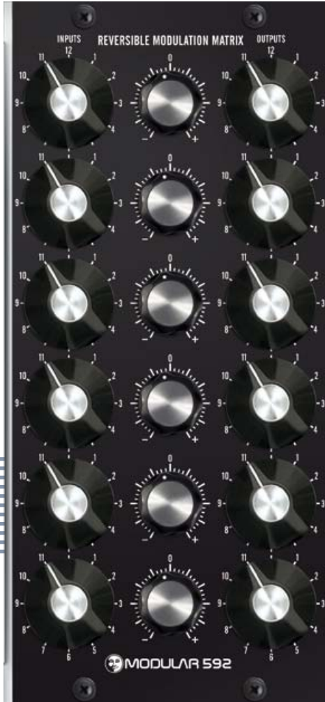
M 592 Main Module