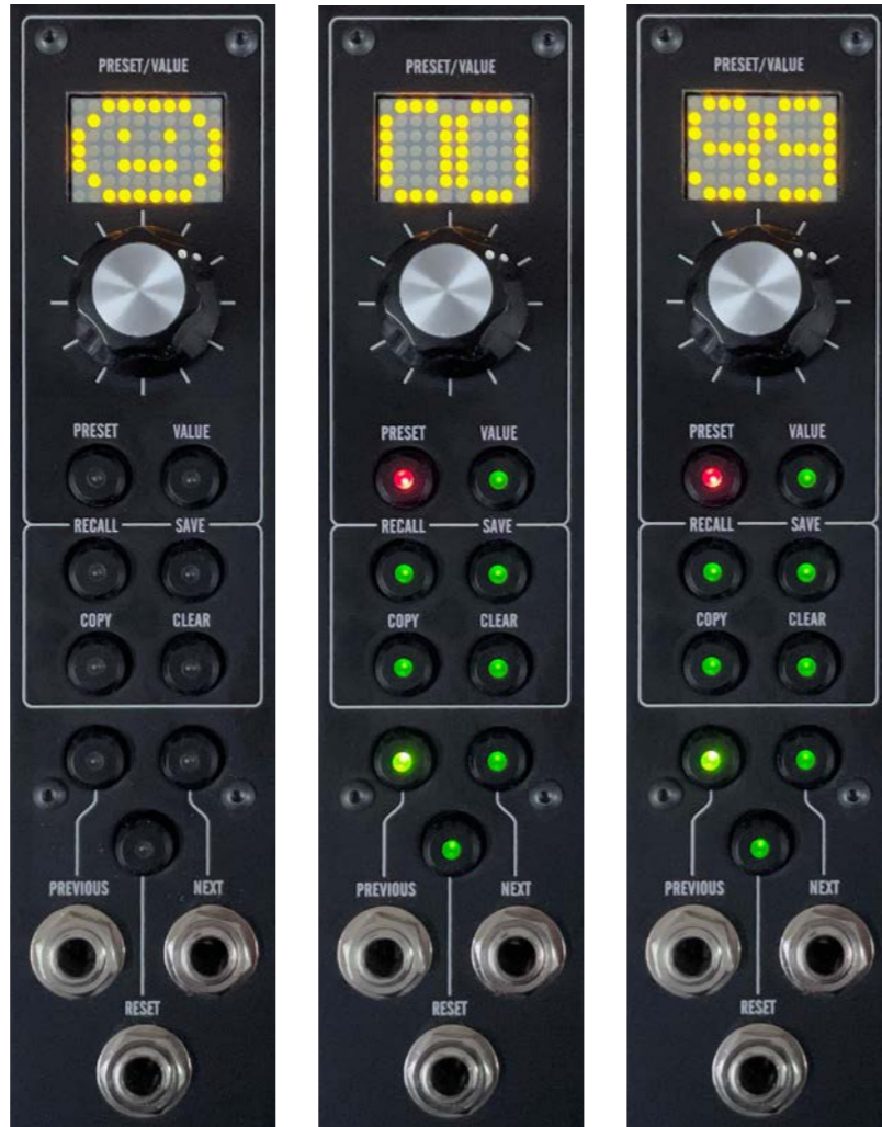
Programmer after power-on

NEXT-jack: Rising edge switches to the next preset (incl. RECALL)